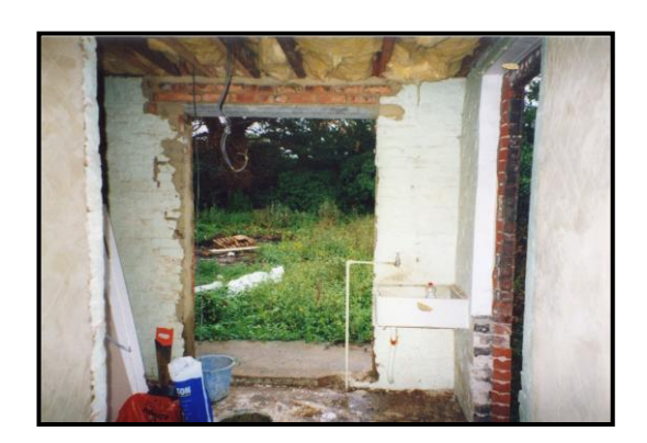
The photo above shows the kitchen being renovated.